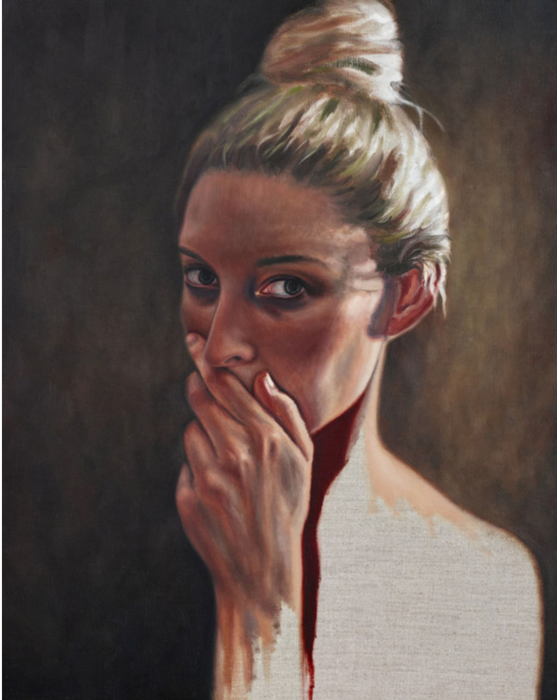
Anxiety still at 30