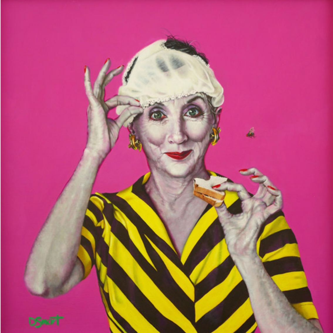
Lunch in the outback