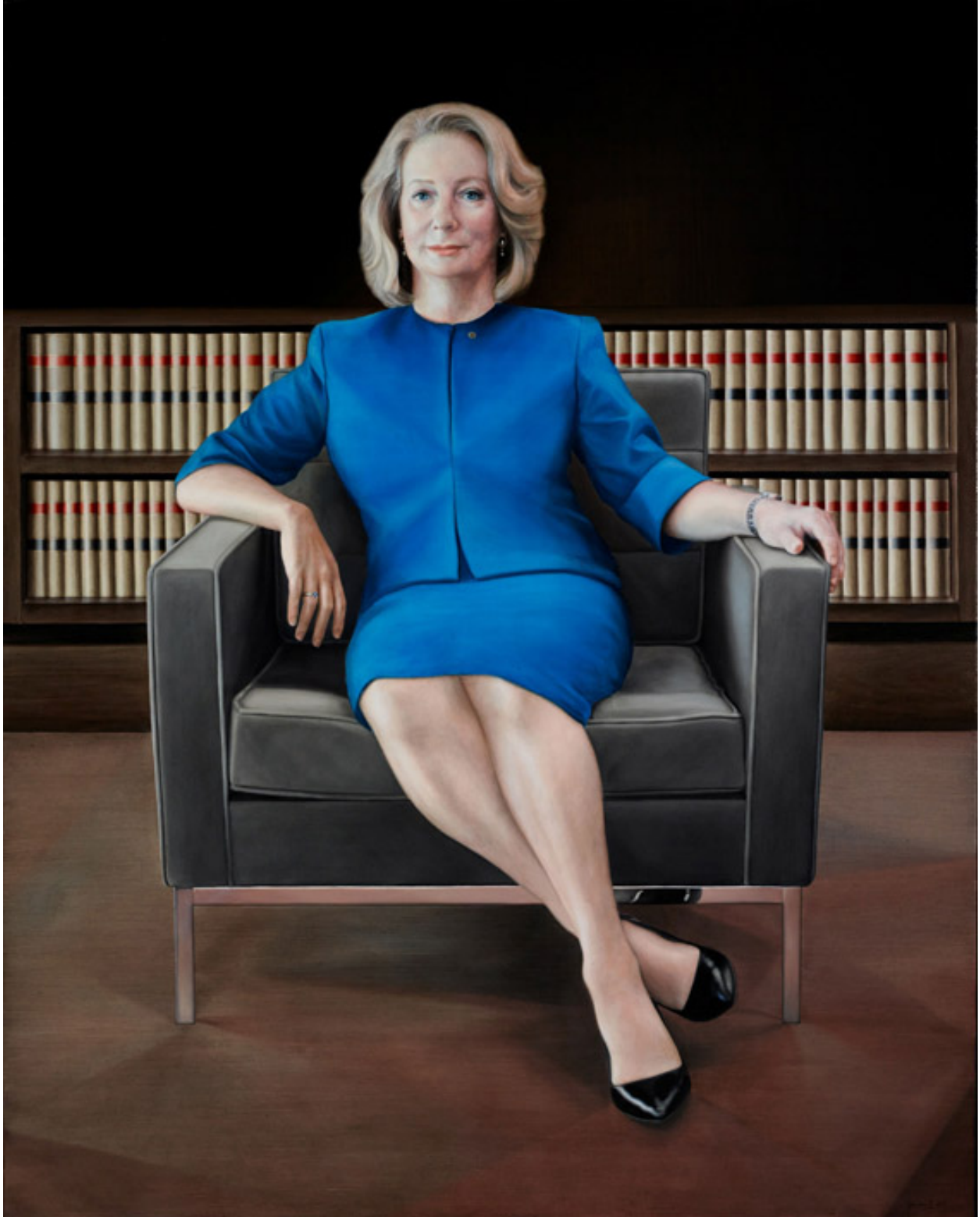
The Honourable Chief Justice Susan Kiefel AC