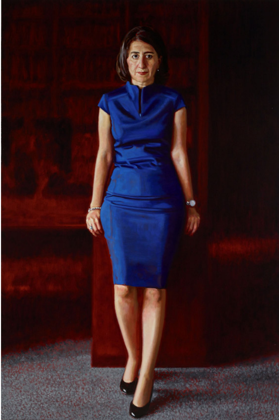
Gladys Berejikian